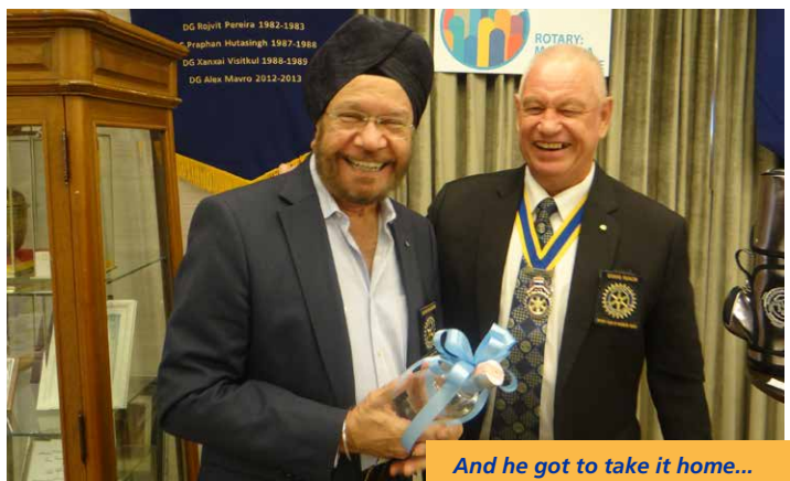
And he got to take it home...