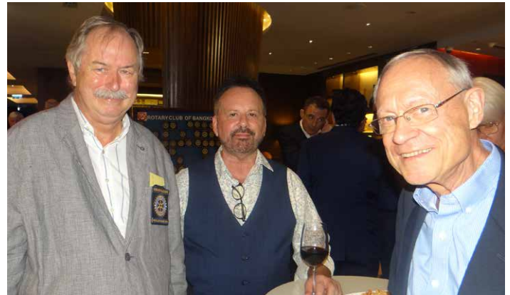
An unusual perspective on three of our more active members