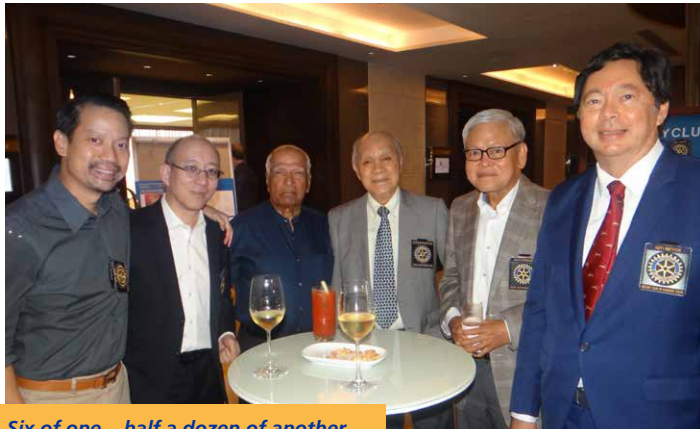
Six of one... half a dozen of another...