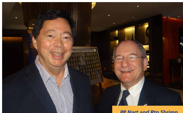
PP Nart and Rtn Shrimp