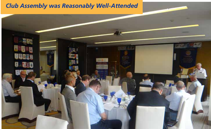
Club Assembly was Reasonably Well-Attended