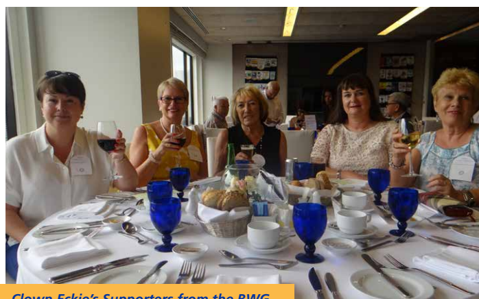
Clown Eckie's Supporters from the BWG