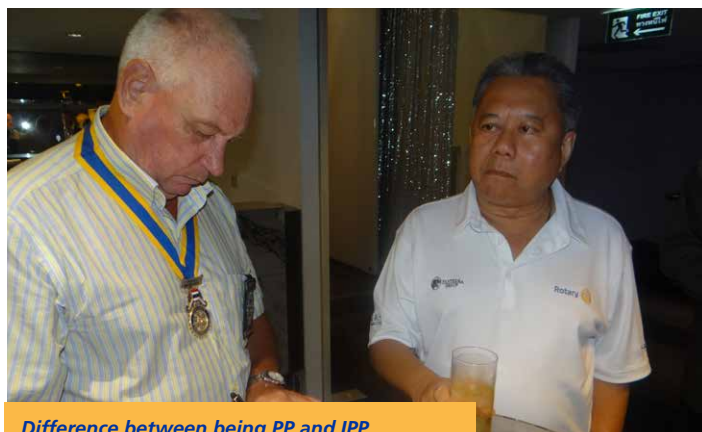
Difference between being PP and IPP