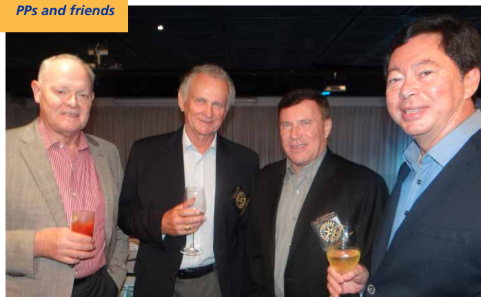
PPs and friends