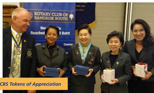
RCBS Tokens of Appreciation