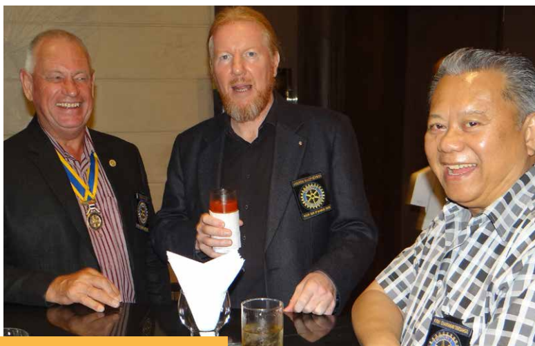
The P, a PP and the IPP