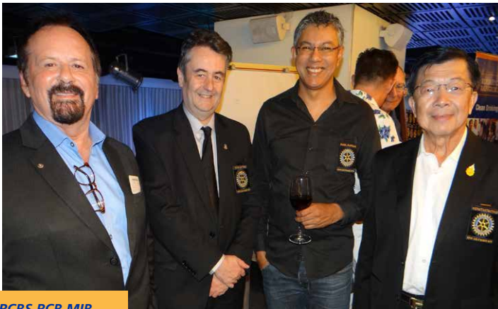
RCBS RCB MIB