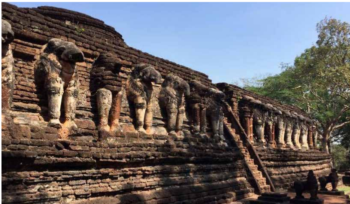
Wat Chang Rop