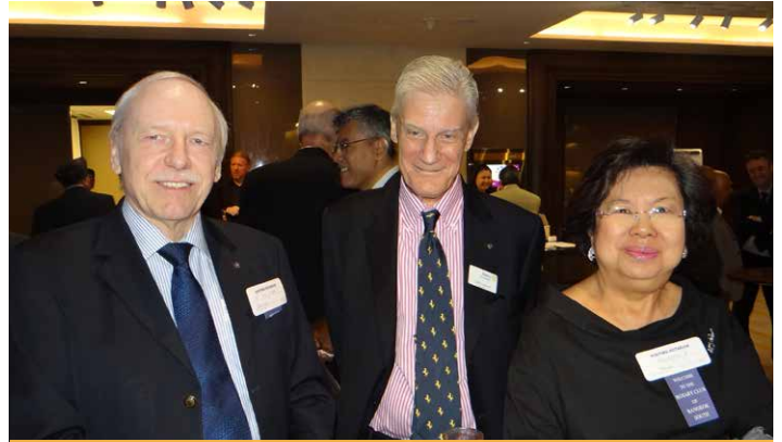
More delegates from RC Bangkok...!