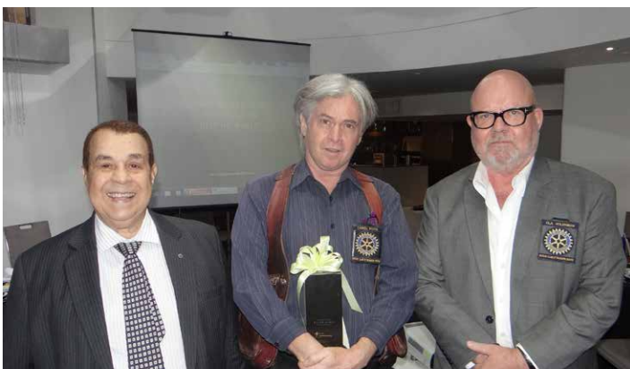
Three generous Rotarians who each gave Baht 2,000 for the same bottle of whisky