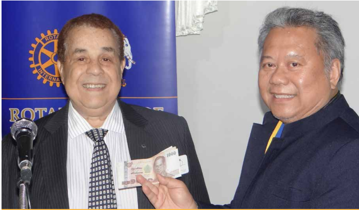
RTN Eid makes a personal donation of Baht 10,000 to P. Krin for Coins on Silom